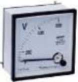
NP series panel meter